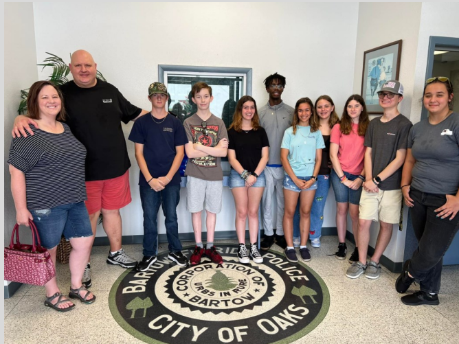
June 15, 2022 First Baptist Church Youth Group delivered goodie bags filled with chocolate chip cookies.

During a very hot weekend in June, Officers Belony and Joseph found a sweet & cold lemonade stand.