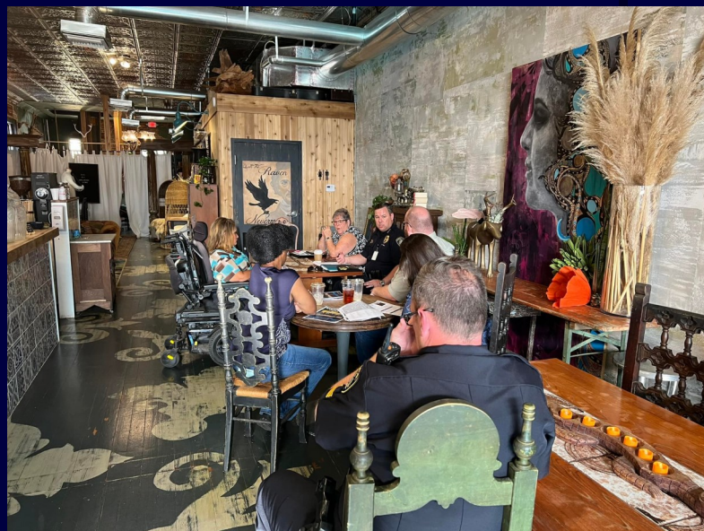
The monthly Chief's Chat was held in the afternoon at 5:30 PM on June 14, 2022 at Unfiltered Coffee Shop in downtown Bartow.